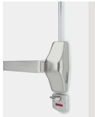
Less Bottom Rod Device